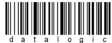
Figure 6 - Code 128 Symbology

This symbology is a very compact bar code for all alphanumeric and numeric only applications. The full (128-character) ASCII character set can be encoded in this symbology without the double characters found in Full ASCII Code 39. If the bar code has four or more consecutive numbers (0–9), the numbers are encoded in double-density mode (where two characters are encoded into one character position). Code 128 also has five special, non data function characters. These are generally used to set reader parameters or return parameters.