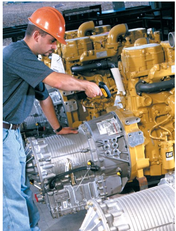
Figure 3 - Datalogic PowerScan RF in a Warehouse

These expanded systems have measurably increased productivity by linking production, warehousing, distribution, sales, and service to management information systems on a batch or real-time basis.