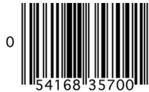
Figure 9 - UPC-A Symbology

The UPC bar code can be printed in two formats, a full 12 digit UPC-A form and a compressed 8 digit UPC-E form. UPC-A and UPC-E also allow two or five digit supplemental numbers. UPC-A and UPC-E codes require checksums.