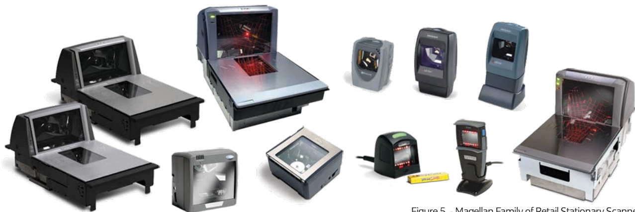
Figure 5 - Magellan Family of Retail Stationary Scanners