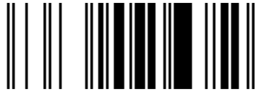
Figure 14 - RSS-14 Symbology

RSS-14 enables encoding of the full 14-digit UCC/EAN Global Trade Item Number (GTIN), the EAN/UCC system for numbering of items. Some formats have omni-directional scanning capabilities. The full height version of RSS-14 has omni-directional scanning capability so that it can be scanned at retail point-of-sale.