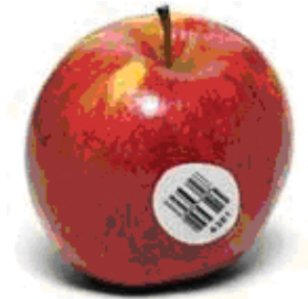
Figure 1 - Apple using an RSS bar code

Whatever the application, whatever the environment, Datalogic makes bar code-based data-collection products that perform in the real world. Please call us today at 1-800-929-3221, option 3 for more information and the name of a reseller in your area who can work with you as you plan your bar code-based solution.