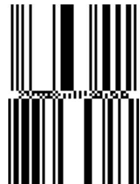
Figure 17 - RSS-14 Stacked Omni-directional Symbology

RSS-14 Stacked Omni-directional is a full-height two-row format. It has the same application as the full-height RSS-14 but is used where a narrower symbol is needed. The separator pattern between the two rows is designed to eliminate cross-row scanning errors.