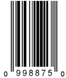
Figure 10 - UPC-E Symbology