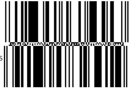
Figure 20 - RSS-14 Expanded Stacked Symbology

RSS Expanded Stacked has the same omni-directional scanning performance as standard RSS Expanded.