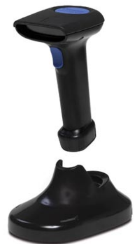
Figure 4 - QuickScan QS6500

The Datalogic QuickScan® and PowerScan® families of hand-held laser scanners, are input devices that use scanning technology for data collection. These input devices permit non-contact scanning of bar code labels on flat, curved and irregular surfaces up to distances of 60 feet and come in undecoded, decoded, and RF models. Decoded models can be connected to any supported PC or terminal as either a keyboard wedge or a serial device. Undecoded models must be used with decoders or with portable data terminals.