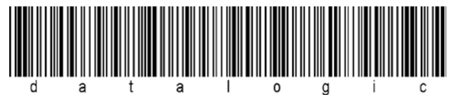
Figure 7 - Code 39 Symbology

Code 39 (or Code 3 of 9) is the most common bar code in use for custom applications. It is popular because it can support both text and numbers (A–Z, 0–9, +, -, ., and space), it can be read by almost any bar code reader in its default configuration, and it is one of the oldest of the modern bar codes. Code 39 is a binary or 2 width bar code, and it can support any number of characters that the reader can scan. Code 39 is specified in many military and government specifications. Code 39 bar codes are self-checking and are not prone to substitution errors. A checksum is not required, but is recommended