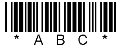
Figure 2 - A typical bar code (Code 39)

A bar code can best be described as an "optical Morse code". Series of black bars and white spaces of varying widths are printed on labels to uniquely identify items. The bar code labels are read with a scanner, which measures reflected light and interprets the code into numbers and letters that are passed on to a computer.